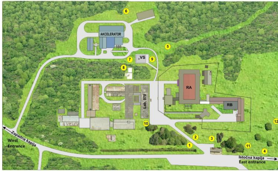
Fig. 4. Sample locations outside the reactor site fence

Activity of these samples were measured using coaxial HPGe detector with Be window, the GX5020 detector manufactured by Canberra (Meriden, Connecticut), connected to a Multiport II multichannel analyser that uses the Genie-2000 gamma analysis software [6]. The detector was specified as having a 50% efficiency relative to a 3x3" NaI(Tl) detector at 1.33MeV.