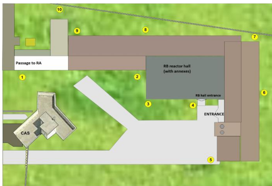
Fig. 3. Sample locations in the vicinity of the reactor RB building