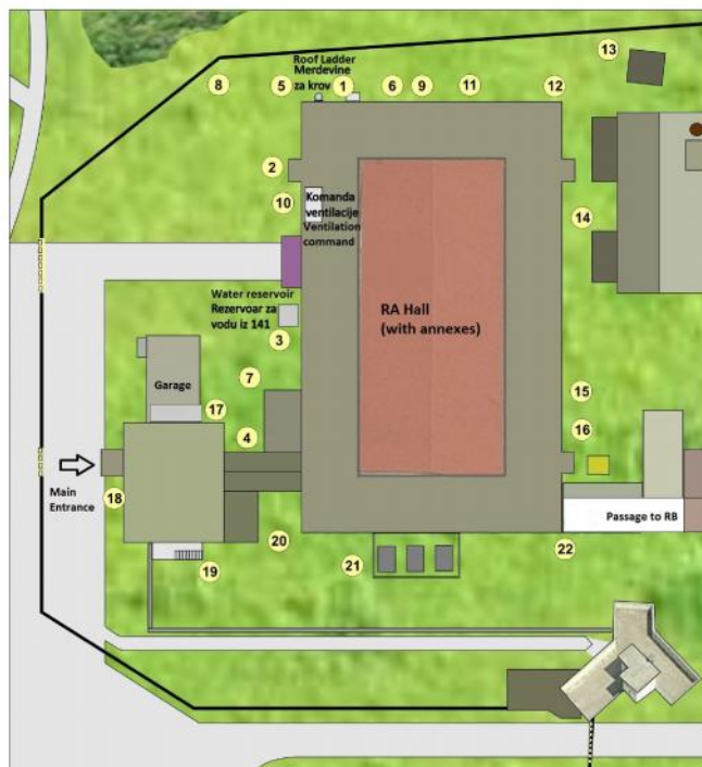
Fig. 2. Sample locations in the vicinity of the reactor RA building

The control group comprises 20 samples of uncultivated soil taken on random locations in Serbia, excavated on the same way as the soil samples at the RA and RB reactor site. Results show that in some cases there is a large difference between the activity measurements in soil taken from the reactor site and those ones from nationwide average levels.